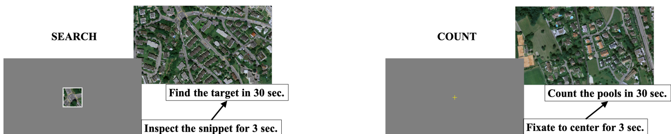
Figure 3: The first two search and count tasks of the first session of the main study.

3.3.4 Results. Participants' performance is summarized in Table 2. Descriptive statistics show that participants searched fastest with the Adjusted COMBO display, whereas their performance with