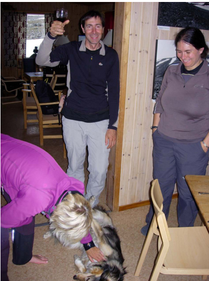
The station dog was glad to have friendly visitors who were clearly taking full advantage of the local hospitality.

food) prepared by the Tarfala staff. The hospitality of the staff and the setting of the venue greatly supported the spirit of intensive and constructive discussions during the workshop. This also included animated conversation in the evenings, stimulated by the diverse specialities that the participants brought along from their home. To calm down afterwards, there was the possibility of taking a hot sauna next to the river until midnight or later!