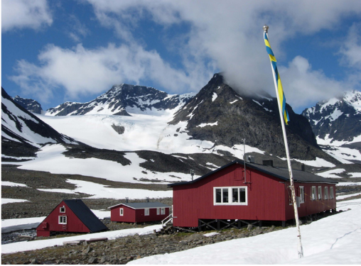
The venue – Tarfala Research Station.

From 9–11 July 2012 the World Glacier Monitoring Service (WGMS), in collaboration with Stockholm University, organized a workshop on measurement and uncertainty assessment of glacier mass balance. The workshop built on the results and experience of earlier workshops in Tarfala in 1998 (Published in Geogr. Ann. A ) and in Skeikampen, Norway, in 2008 (published in Ann. Glaciol. ). It was held at the Stockholm University Tarfala Research Station in northern Sweden. The major aims of the workshop were to discuss methods and to identify and quantify related uncertainties of mass balance measurements from the ground, air and space, as well as to provide