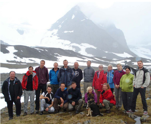
The workshop participants, with Isfallsglaciären in the background.

The first day of the workshop included keynote presentations as input for the subsequent discussions on how to tackle the issues mentioned above. These covered uncertainties and problems