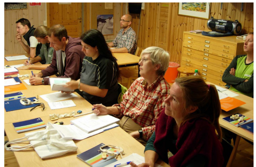
The audience was attentive.