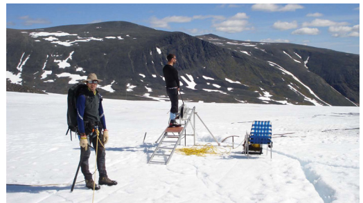
The interior of Storglaciären is equally well investigated.