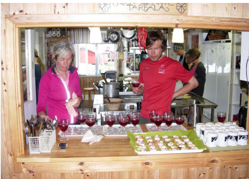
Is everything ready for drinks?

PS: A detailed workshop report is available from: http://www.wgms.ch/mbw_tarfala.html