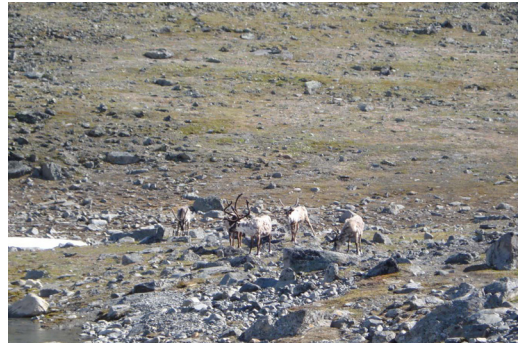
The local reindeer ignored the excursion group.