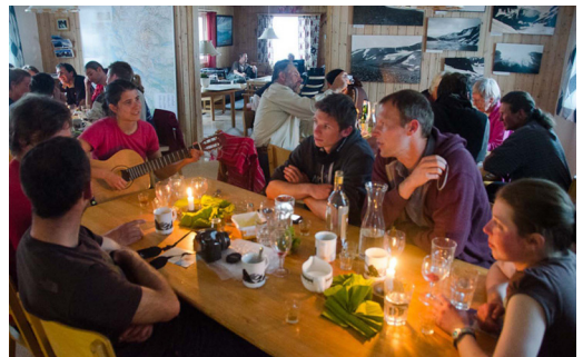
The workshop participants and the station staff enjoyed a festive dinner together.