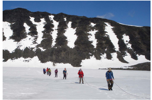
An easy walk on Storglaciären.