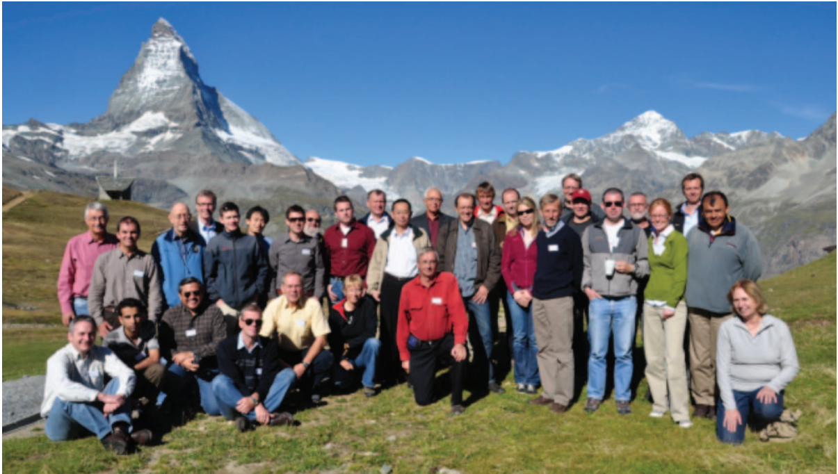
Figure 2. Participants of the WGMS General Assembly of the National Correspondents at Riffelberg in Zermatt, Switzerland, on September 3, 2010.

address on the historical background of international glacier monitoring and the integration of in situ measurements within the GTN-G strategy. Subsequent to the talk, national correspondents (or their deputies) gave overviews on the status and challenges of glacier monitoring in their respective countries.